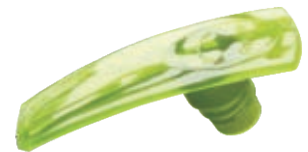
Material:PP Weight:2.0G Thickness:1.5mm Nozzle type:PRM 15 CL