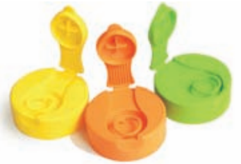
Material:PE-LD Weight:10G Thickness:1.2mm Nozzle type:PRM 18 CC