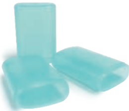
Material:PP Weight:8G Thickness:0.5mm Nozzle type:PRM 18 CC