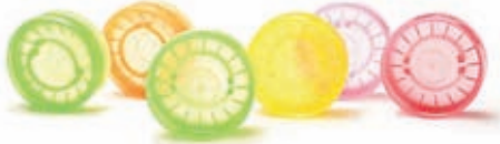
Material:PE-LD Weight:7.4G Thickness:1.5mm Nozzle type:PRM 18 CC