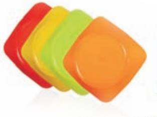
Material:PP Weight:14G Thickness:1.8mm Nozzle type:PRM 18 VE