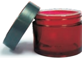
Material:PMMA Weight:20G Thickness:2.0mm Nozzle type:PRM 25 VV