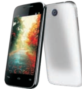
Mobile Phone Panel